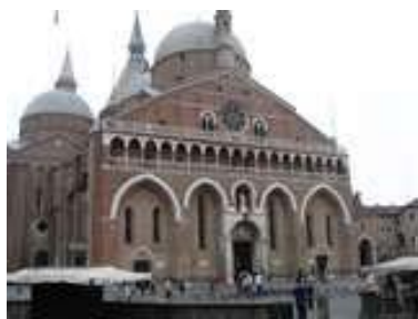
St. Anthony, Padua

Arrive in VENICE by mid-day and meet your Renaissance Group tour escort after clearing customs. You will be escorted to your private motorcoach for